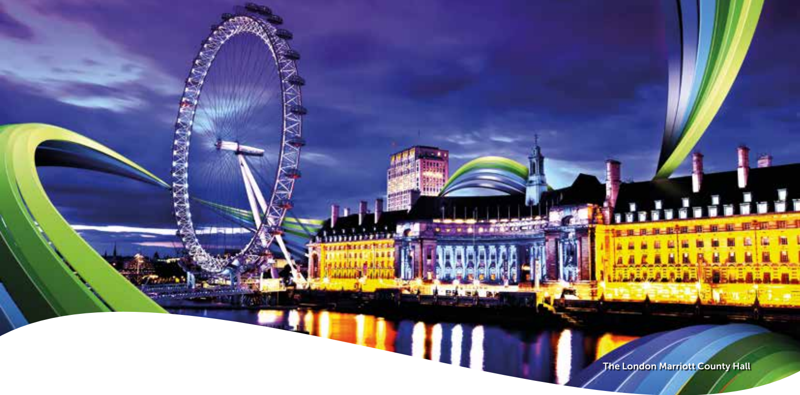
The London Marriott County Hall

Essential services for business, delivered with energy.